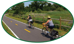
Marion Township Greenway Project